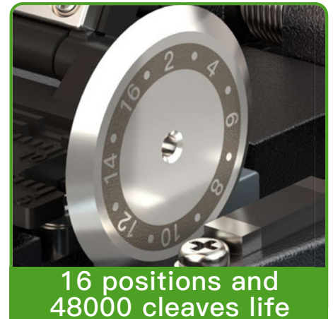
16 positions and 48000 cleaves life